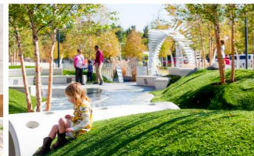
PROJECT GROUNDLEVEL LANDSCAPE ARCHITECTURE